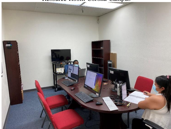
Resource Room-Corona Campus